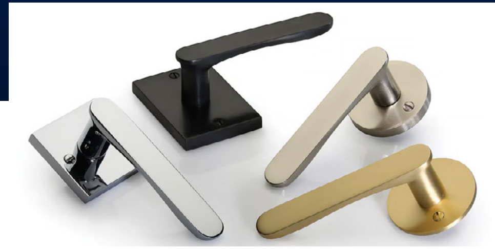
Ashley Norton's Lucas lever is available in bronze and brass. (Ashley Norton)

Ashley Norton ) ( Doors ) ( Design ) ( FF&E